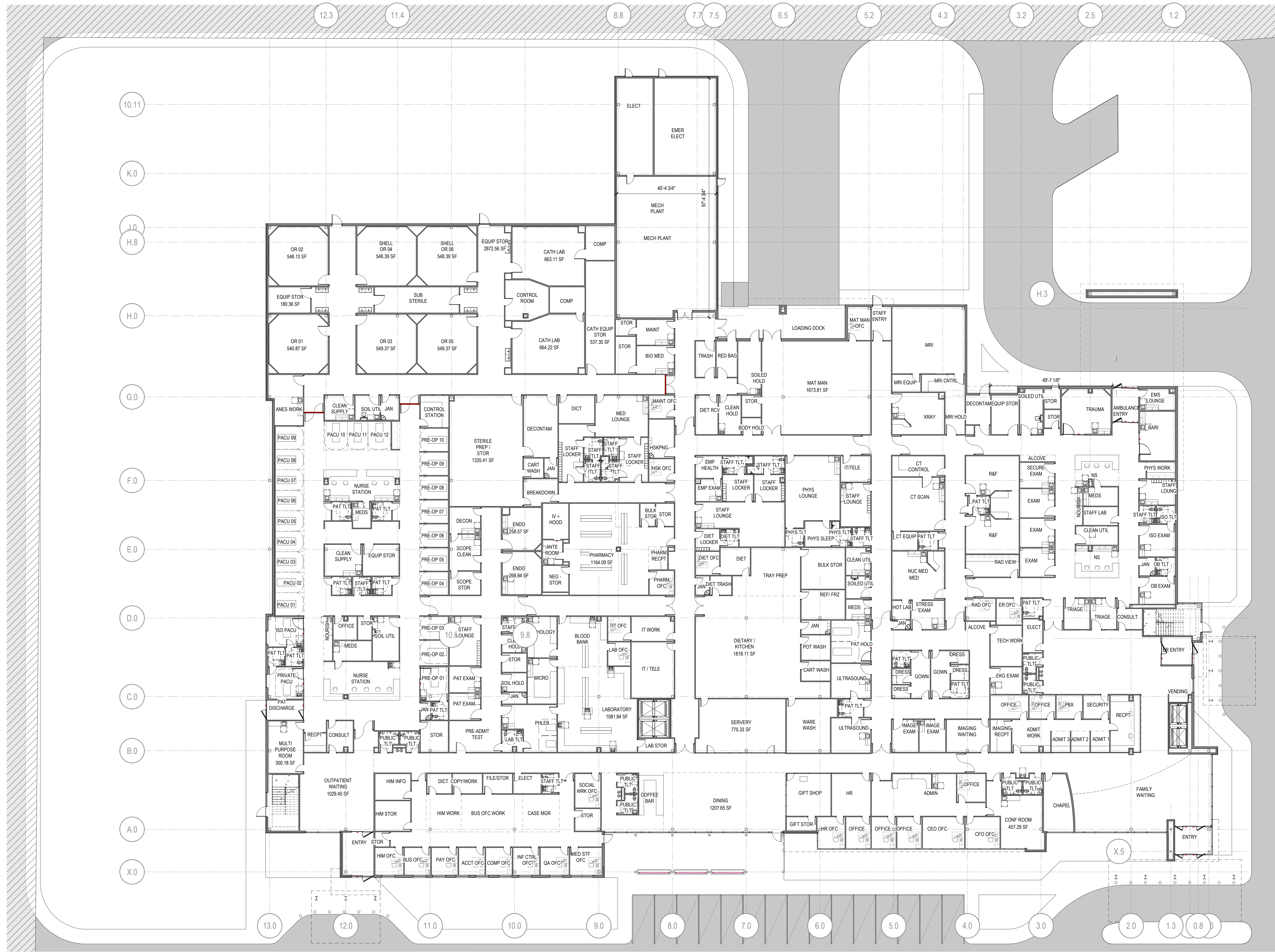
01 FLOOR PLAN-LEVEL 1 A1-10 1/16" = 1'-0"